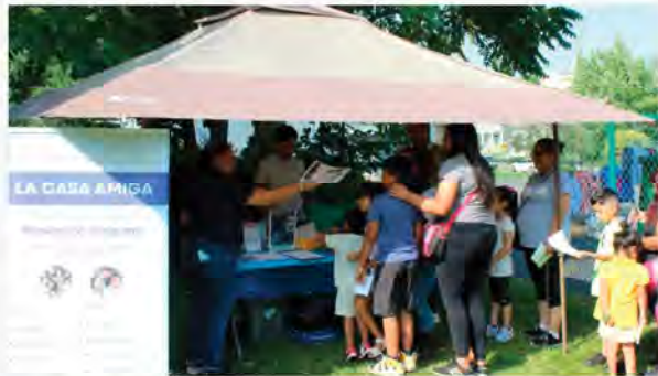
La Casa Amiga provides program information to more than 250 families at their annual Back-to-School event in August.