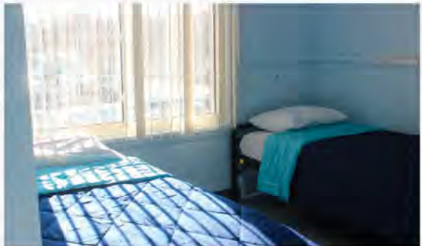
Saint Joseph Center of Hope crisis intervention and recovery center (pictured above) recently received The Monroe Community Mental Health Authority Annual "Going Above and Beyond" Award.