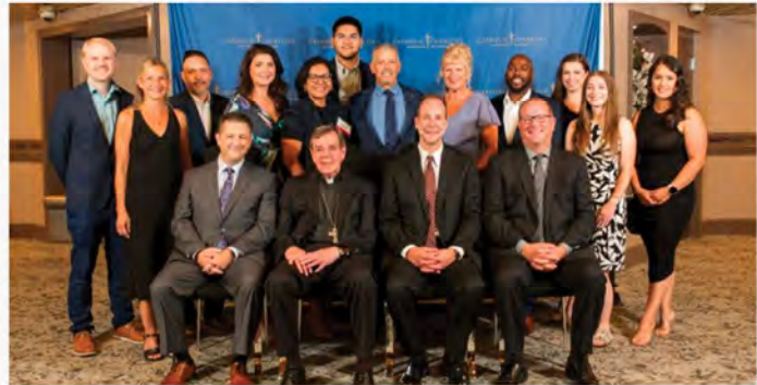
Donors supported The Residences at St. Matthew , raising more than $125,000 to provide supportive services for 25 future residents. Scan the code to view The Residences at St. Matthew video.