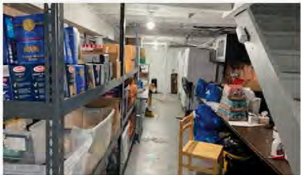
Our food pantries serving Detroit are on the move and in demand. The Center for the Works of Mercy will relocate across from The Cathedral of the Blessed Sacrament this fall and become the distribution hub for all of our food programs in Southeast Michigan.