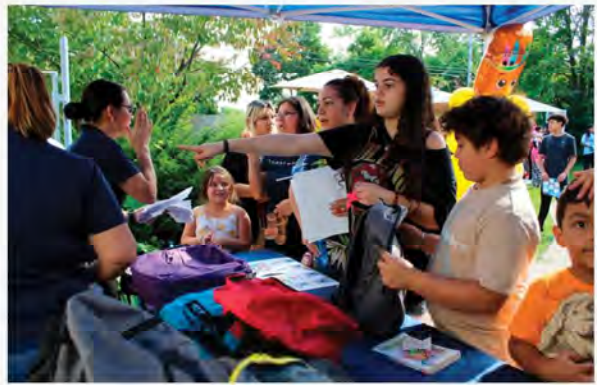
The La Casa Amiga Back-to-School event equipped 435 young students to succeed in school with backpacks and school supplies... thanks to YOU!

Thanks to the support of donors like YOU , this past summer our Saint Joseph Center of Hope was invited to partner with the Monroe County Sheriff's Office in an effort to bring awareness of resources available to those struggling with substance use issues and won 1st Place for their parade float at the Monroe County Fair.