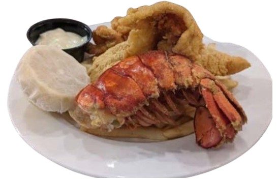
cajun catfish and lobster entree