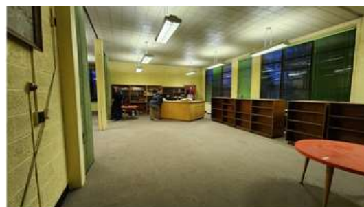
St. Matthew Library 2