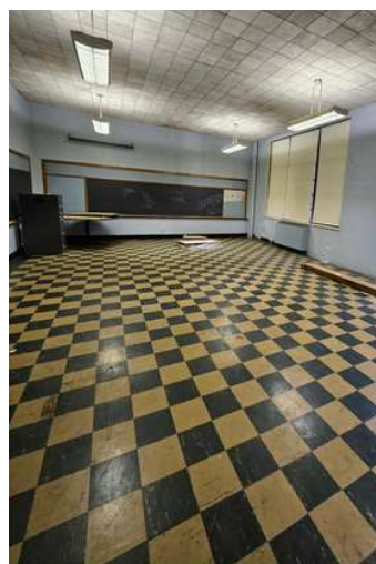
St. Matthew Classroom

A closing date of October 31 will result in both the school and activities buildings being sold to Catholic Charities of Southeast Michigan. The project - "The Residences at St. Matthew" - is a new housing development that will repurpose the buildings into quality, affordable apartments and permanent supportive housing. Forty-six units (36 one-BR, 4 two-BR and six studio) will be developed within the buildings. Health and social services will be available on site through a joint partnership of CCSM and Ascension Michigan. The former gymnasium will be converted into a multi-purpose space related to these services which will be available to both tenants and community residents. This project is a $20.5 million project - financed with multiple partners including the City of Detroit, State of Michigan (MSHDA) housing tax credits, philanthropy, national historical tax credits and private investors. The construction timeframe is estimated to take 12-15 months to complete. This is the largest investment in the immediate St. Matthew neighborhood in more than 50 years. The development team has actively engaged with community representatives for the past three years and has been positively supported throughout the process.