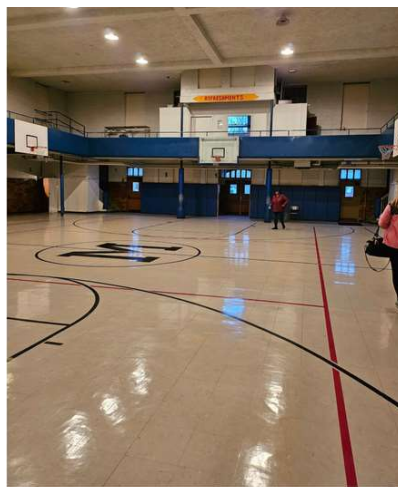
St. Matthew Gym