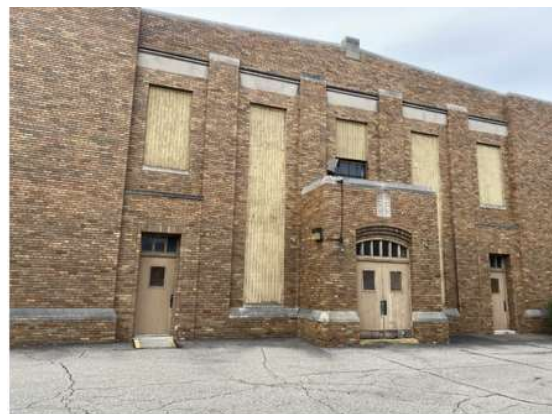
St. Matthew School Building