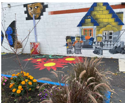
Secret Garden Gallery space

The East English Village Association does not endorse any advertisers, political parties, candidates or businesses